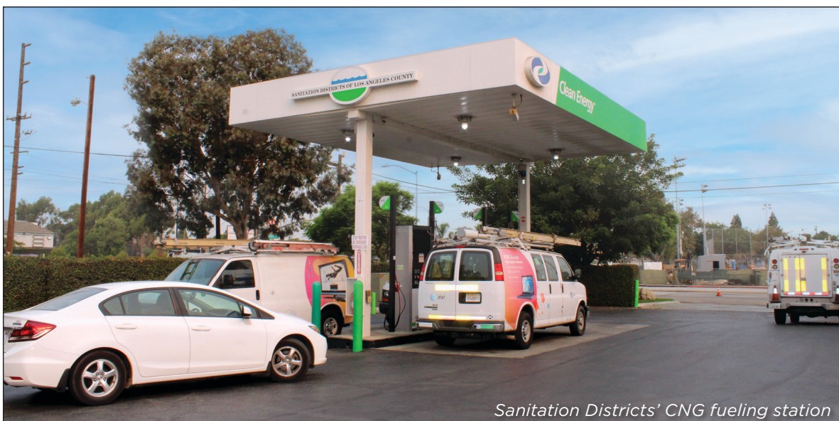
Sanitation Districts' CNG fueling station

The biogas is used in two ways. Some is sent to the JWPCP's power plant where the biogas is converted into electricity that run the treatment plant. The remaining biogas is sent to a gas purification system to make fuel-grade renewable natural gas. The purification system is capable of producing the renewable natural gas equivalent of 2,000 gallons of gasoline per day. This renewable natural gas is dispensed at the Sanitation Districts' nearby compressed natural gas (CNG) fueling station that is open to the public. By fueling cars, buses and trucks with renewable natural gas, this program reduces the need for fossil fuels.